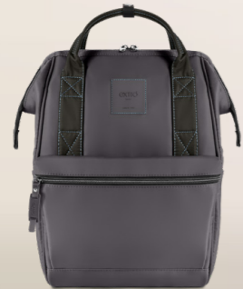
Smoke Gray / Gray / Light Blue Stitchings ZAM.01.12 MEDIUM