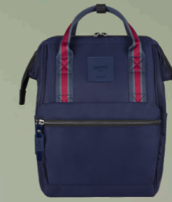
Blue Navy/Red, Blue and Gray limited edition ZAS.01.06 SMALL