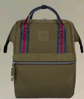
Oliva/Red, Blue and Gray limited edition ZAM.01.10 MEDIUM