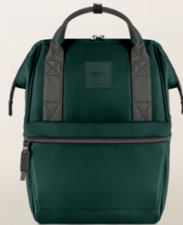
Bottle Green / Smoke Gray ZAM.01.15 MEDIUM