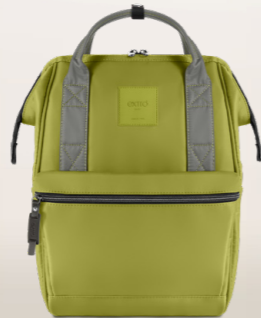
Acid Green / Gray ZAM.01.14 MEDIUM