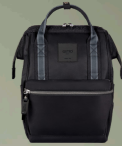
Black/Black and Gray limited edition ZAS.01.07 SMALL