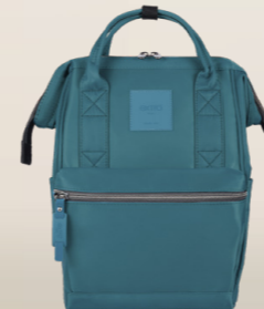
Blue Avio ZAS.01.02 SMALL