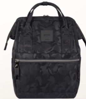
Black Camo ZAM.01.06 MEDIUM