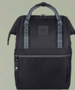
Black/Black and Gray limited edition ZAM.01.07 MEDIUM