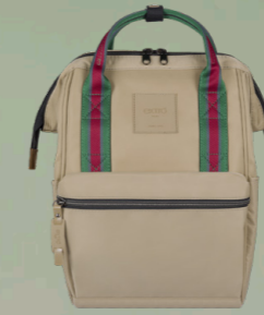
Sand/Red, Green and Gray limited edition ZAS.01.05 SMALL