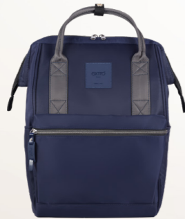
Blue Navy / Gray ZAM.01.02 MEDIUM