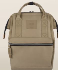
Sand ZAS.01.01 SMALL