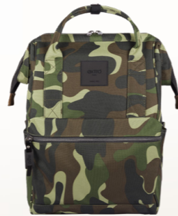
Camouflage ZAM.01.05 MEDIUM