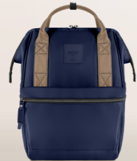
Blue Navy / Kaki ZAM.01.13 MEDIUM