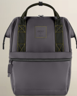
Smoke Gray / Gray / Yellow Stitchings ZAM.01.11 MEDIUM