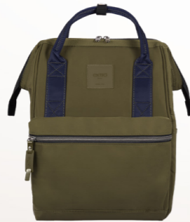
Olive / Blue Navy ZAM.01.03 MEDIUM