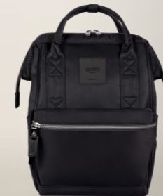
Black ZAS.01.03 SMALL