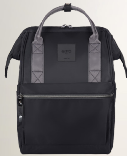
Black / Gray ZAM.01.01 MEDIUM