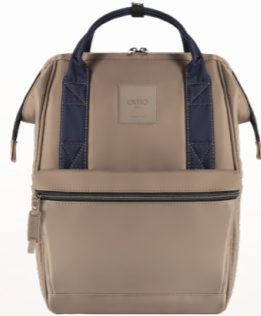
Kaki / Blue Navy ZAM01.04 MEDIUM