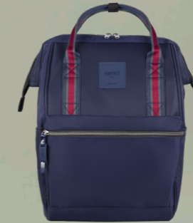
Blue Navy/Red, Blue and Gray limited edition ZAM.01.08 MEDIUM