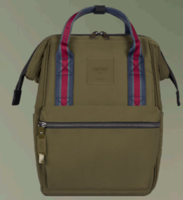
Oliva/Red, Blue and Gray limited edition ZAS.01.08 SMALL