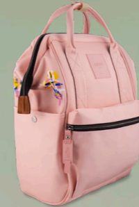
Rose Quartz BagPack d'Autore ZAS.01.04 SMALL