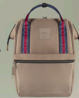
Kaki/Red, Blue and Gray limited edition ZAM.01.09 MEDIUM