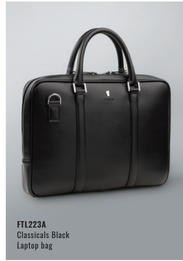
FTL223A Classicals Black Laptop bag