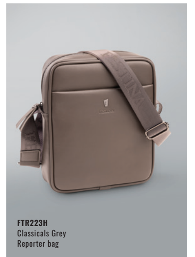
FTR223H Classicals Grey Reporter bag

The Classicals bag line is made of Vegan leather (PU). Bags are delivered in a FESTINA Nylon bag.