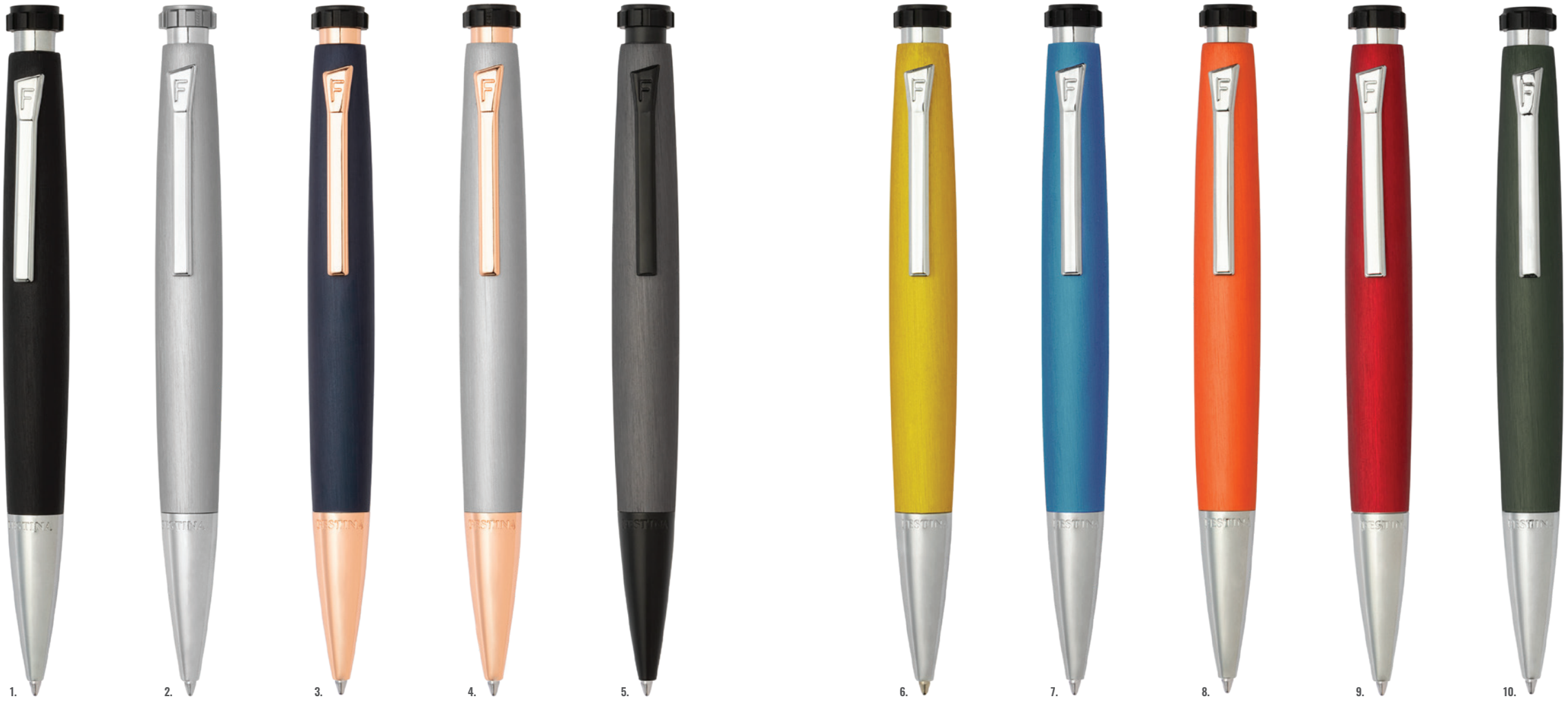
1. FSC1414A Chronobike Classic Chrome Black Ballpoint pen