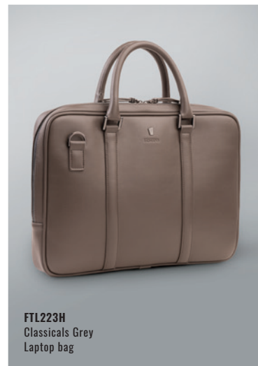
FTL223H Classicals Grey Laptop bag