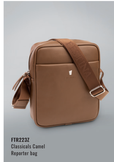
FTR223Z Classicals Camel Reporter bag