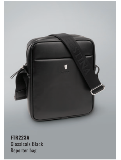
FTR223A Classicals Black Reporter bag