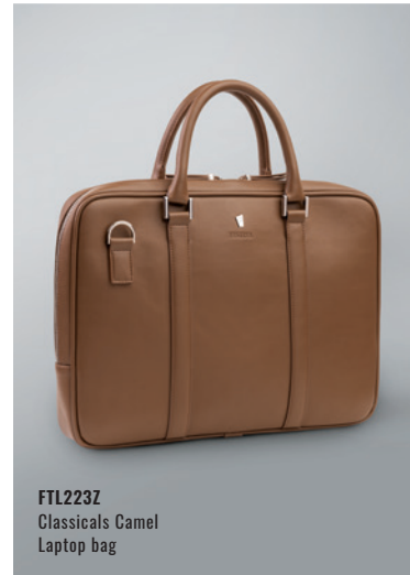
FTL223Z Classicals Camel Laptop bag