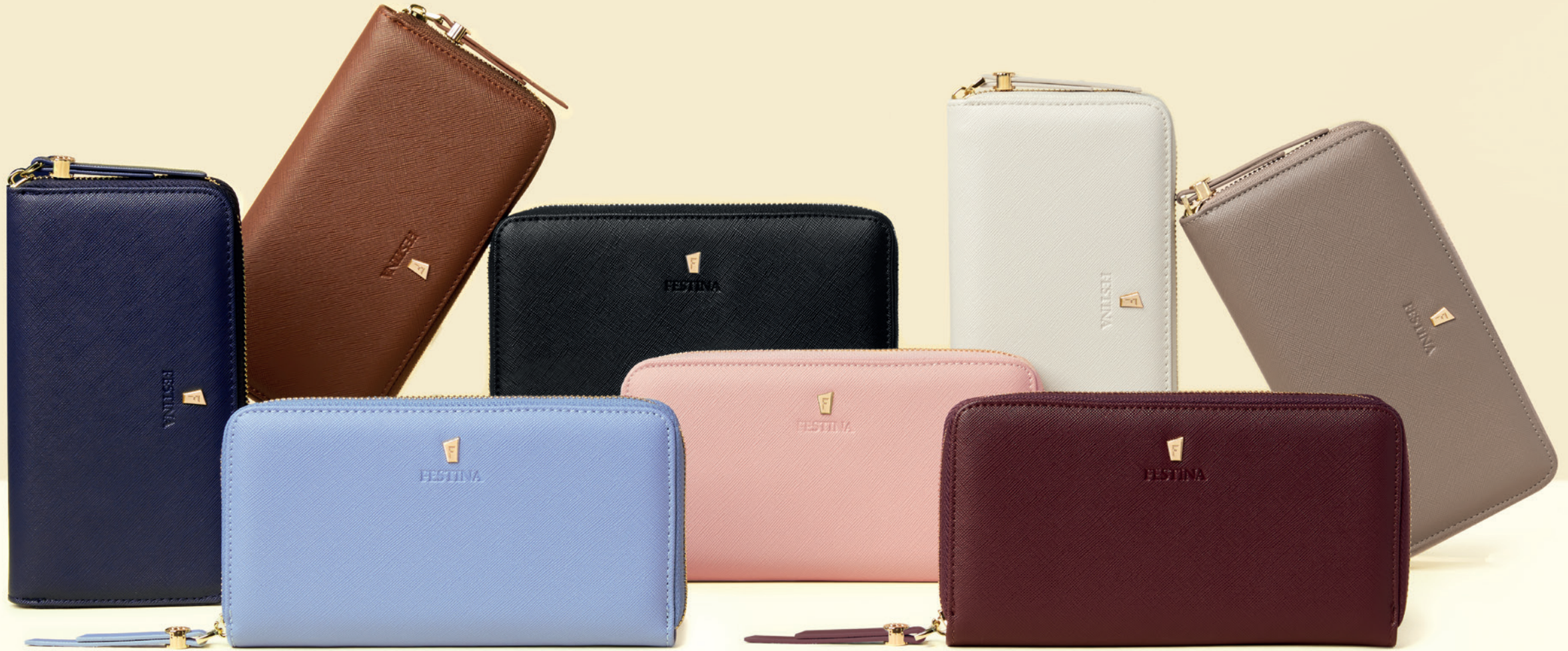
FEL222A Mademoiselle Black Travel wallet