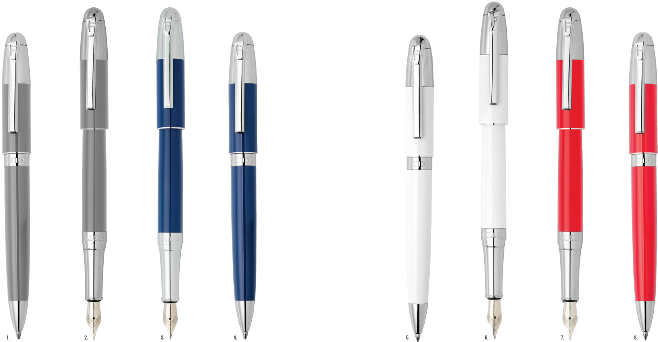
1. FSN1964H Classicals Chrome Grey Ballpoint pen