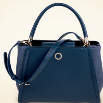
Alix lady bag navy CTX334N