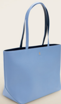
Mademoiselle lady bag light blue FTX322M