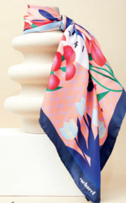
Alix scarf navy CFM334N