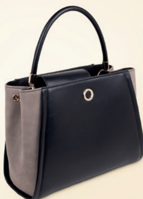
Alix lady bag black CTX334A