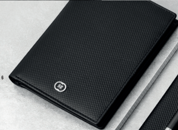
6. Regent travel wallet black - NLT329A