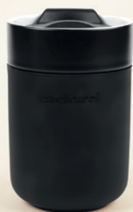
Alix isothermal flask black CAI334A