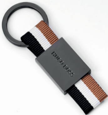
Iconic key ring style HAK385D