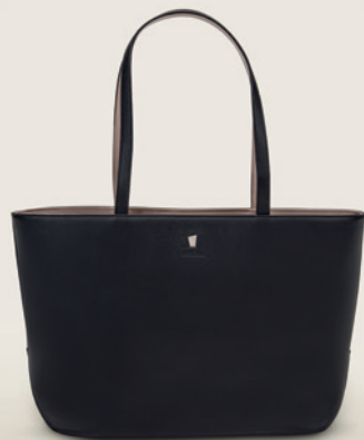
Mademoiselle lady bag black FTX322A