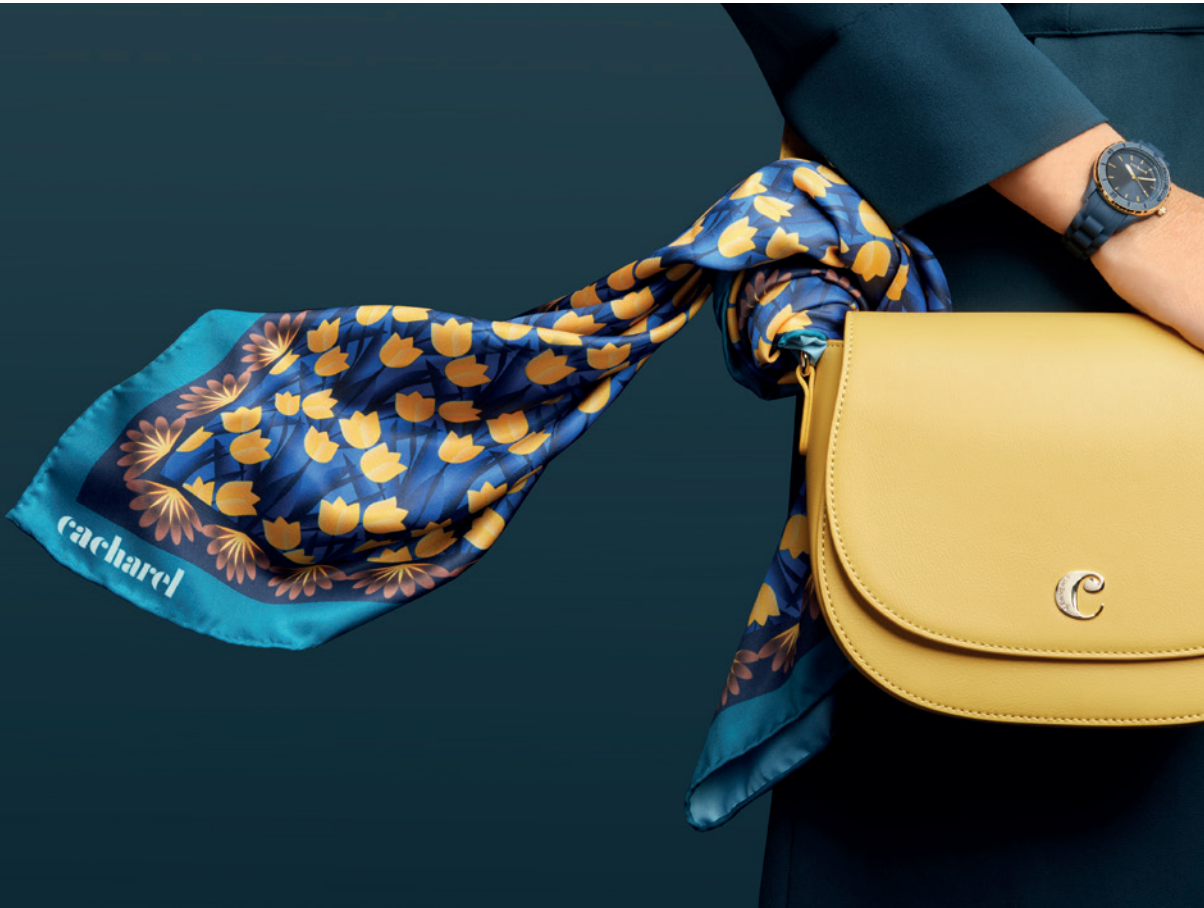
Albane scarf green - CFL333T