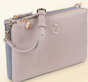
Alix lady bag nude CTW334X