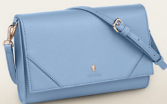
Mademoiselle lady bag light blue FTW322M