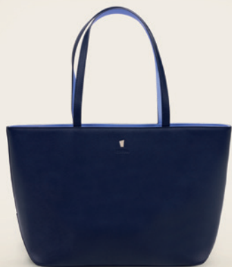
Mademoiselle lady bag navy FTX322N