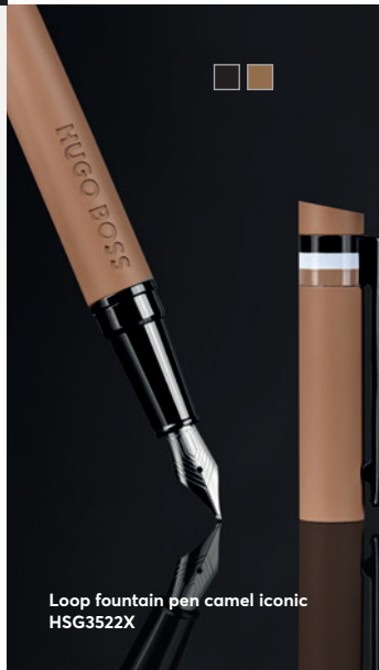
Loop fountain pen camel iconic HSG3522X