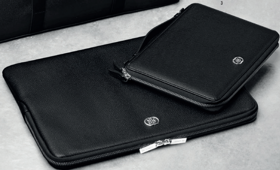
1. Regent laptop sleeve black - NTE329A