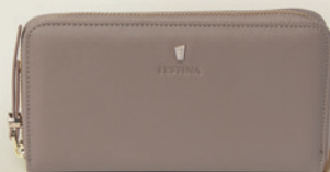
Mademoiselle travel wallet beige FEL222X