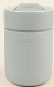
Alix isothermal flask grey CAI334K