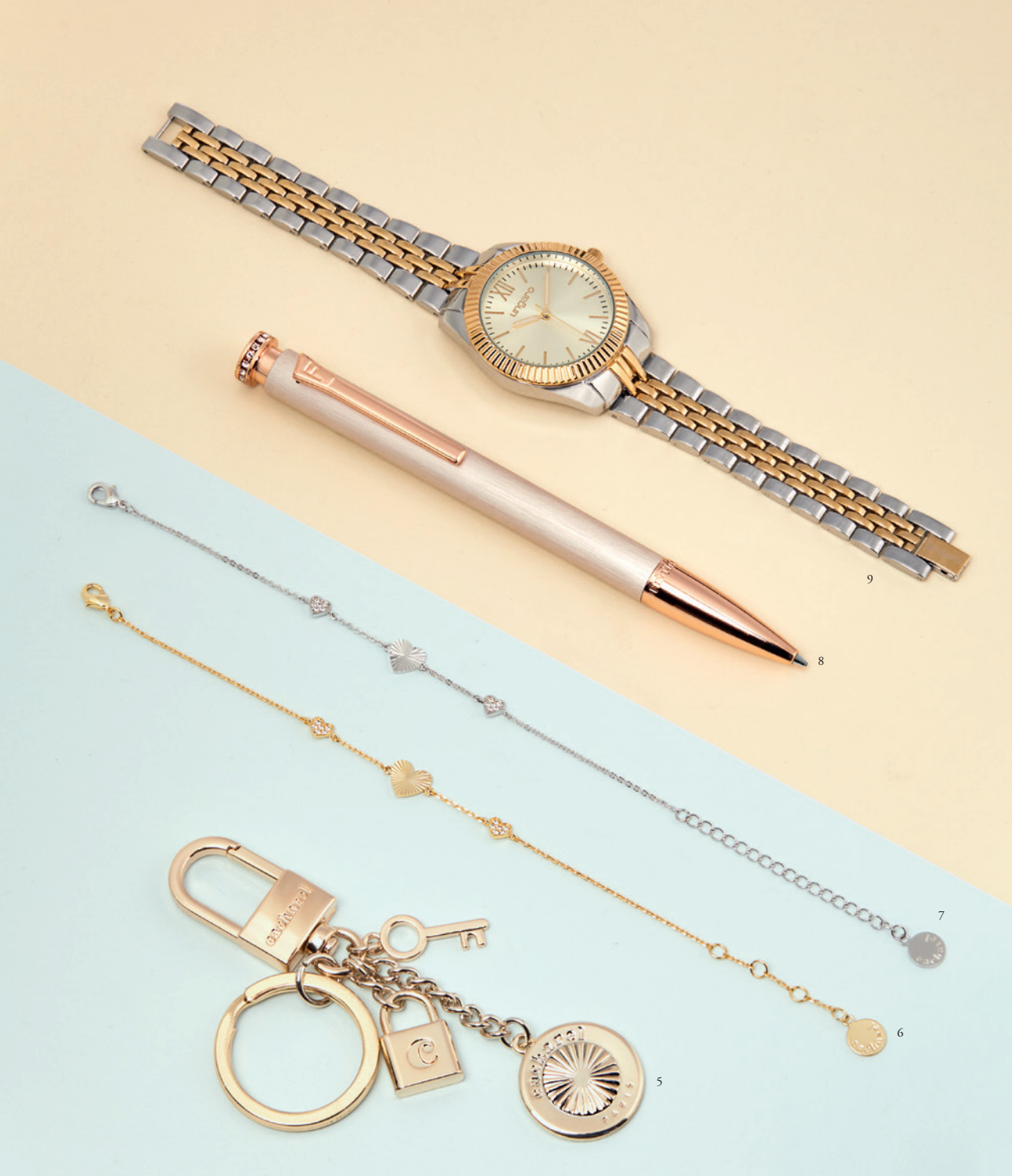
1. Alma dressing-case light grey - cacharel - CTC219K