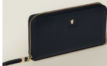
Mademoiselle travel wallet black FEL222A