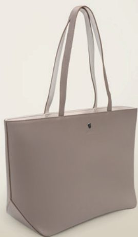
Mademoiselle lady bag beige FTX322X