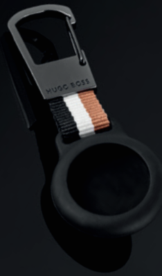
Iconic key ring with airtag holder HAA363D