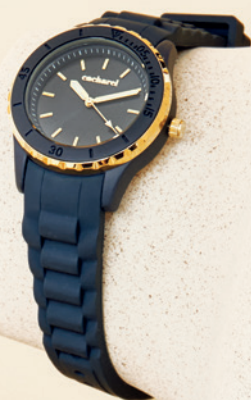
Albane watch navy CMN333N