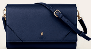
Mademoiselle lady bag navy FTW322N